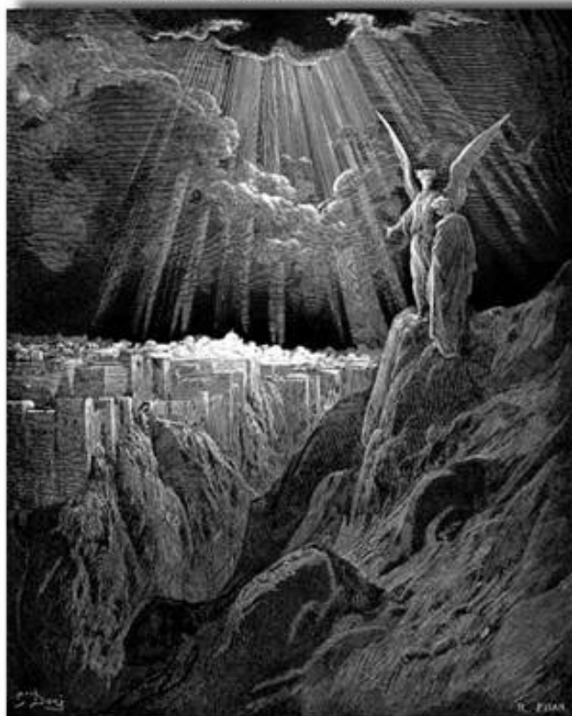
"The New Jerusalem" by Gustave More