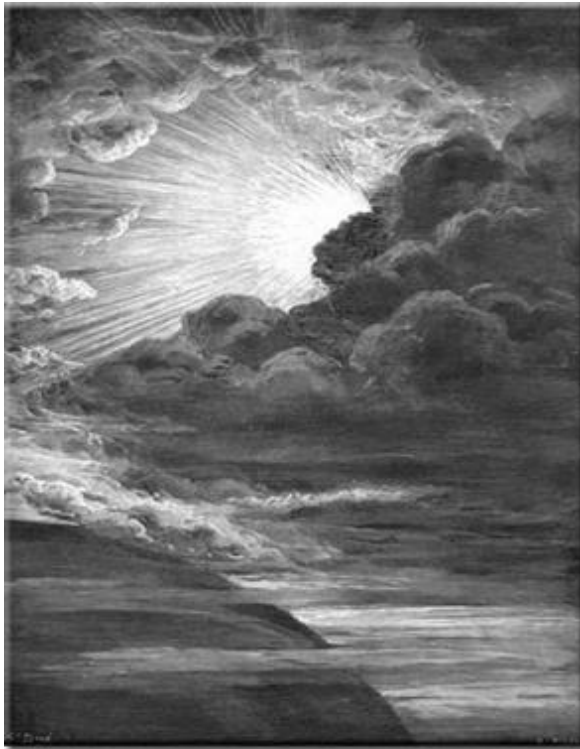
THE MYSTERY OF GOD THE FATHER