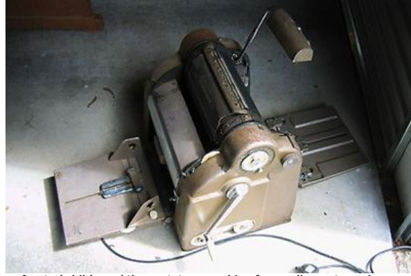
Old photos of a study bible and the gestetner machine for sending out prophecy and writings.